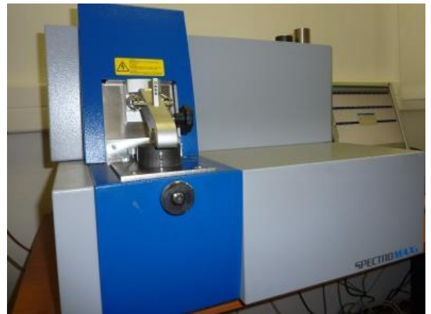
Spectrometer SPECTROMAXX F