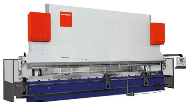
Newest machine in our machine park: press brake Bystronic Xpert 800 (L=6200mm)