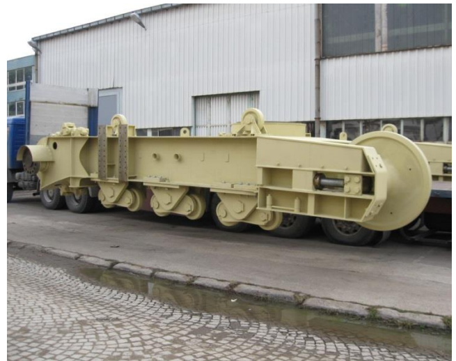
Parts of spreader ARS 2000, Kostolac – Serbia