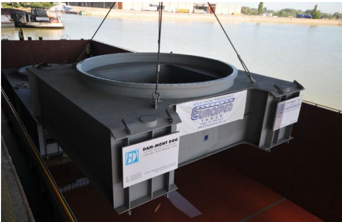
Base frame on river barge, project Cöllolar-Turkey