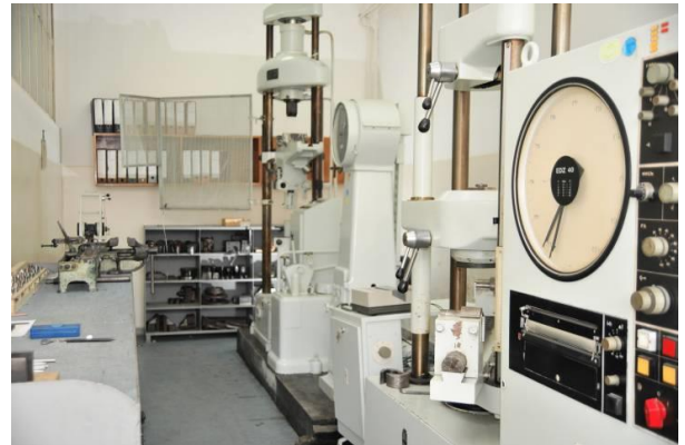
Laboratory for mechanical testing