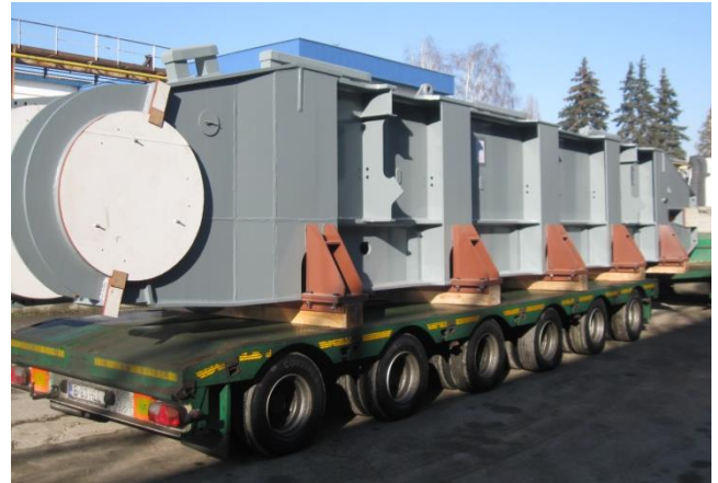
Parts for project Esteril-Brazil