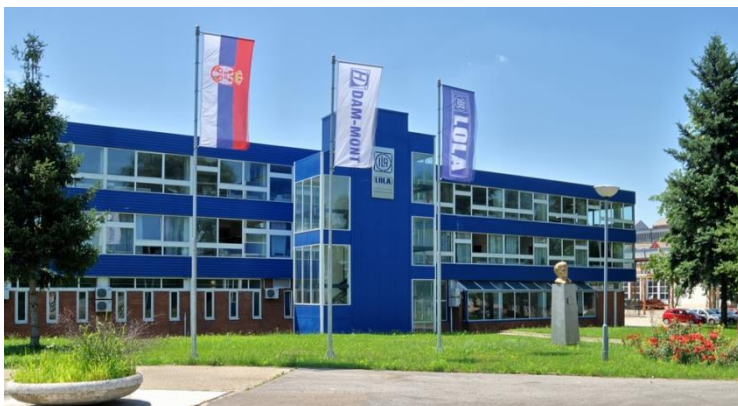
Company locations in Belgrade (Lola) and Dvorište, Serbia

Since 2007, Dam-Mont owns Lola Livnica-Pom, Belgrade which consists of two main business units, foundry and manufacturing of process equipment and machinery. The range of products and production capacities have been considerably broadened with the acquisition of Lola production facilities in Belgrade.