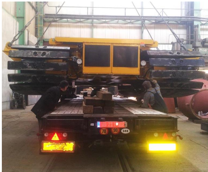
Transport crawler T250 Brazil