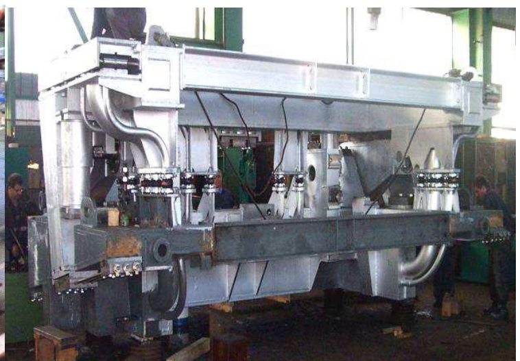
Plug in unit, Severstal, Russia